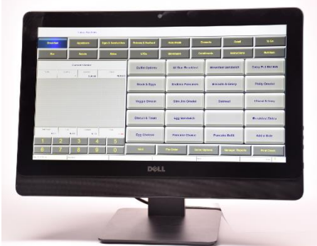
Traditional Counter Touchscreen