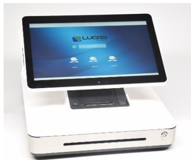
Food Truck/Venue Touchscreen