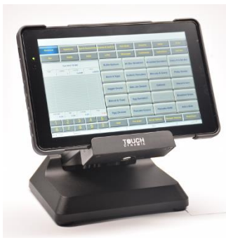
Tablet w/ Docking Station